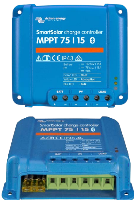
SmartSolar Charge Controller MPPT 75/15