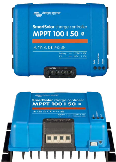
SmartSolar Charge Controller MPPT 100/50